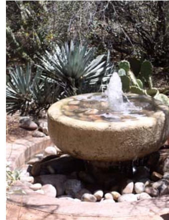
The Desert Botanical Garden