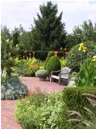
Chicago Botanic Garden