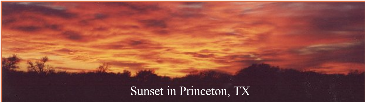
Sunset in Princeton, TX